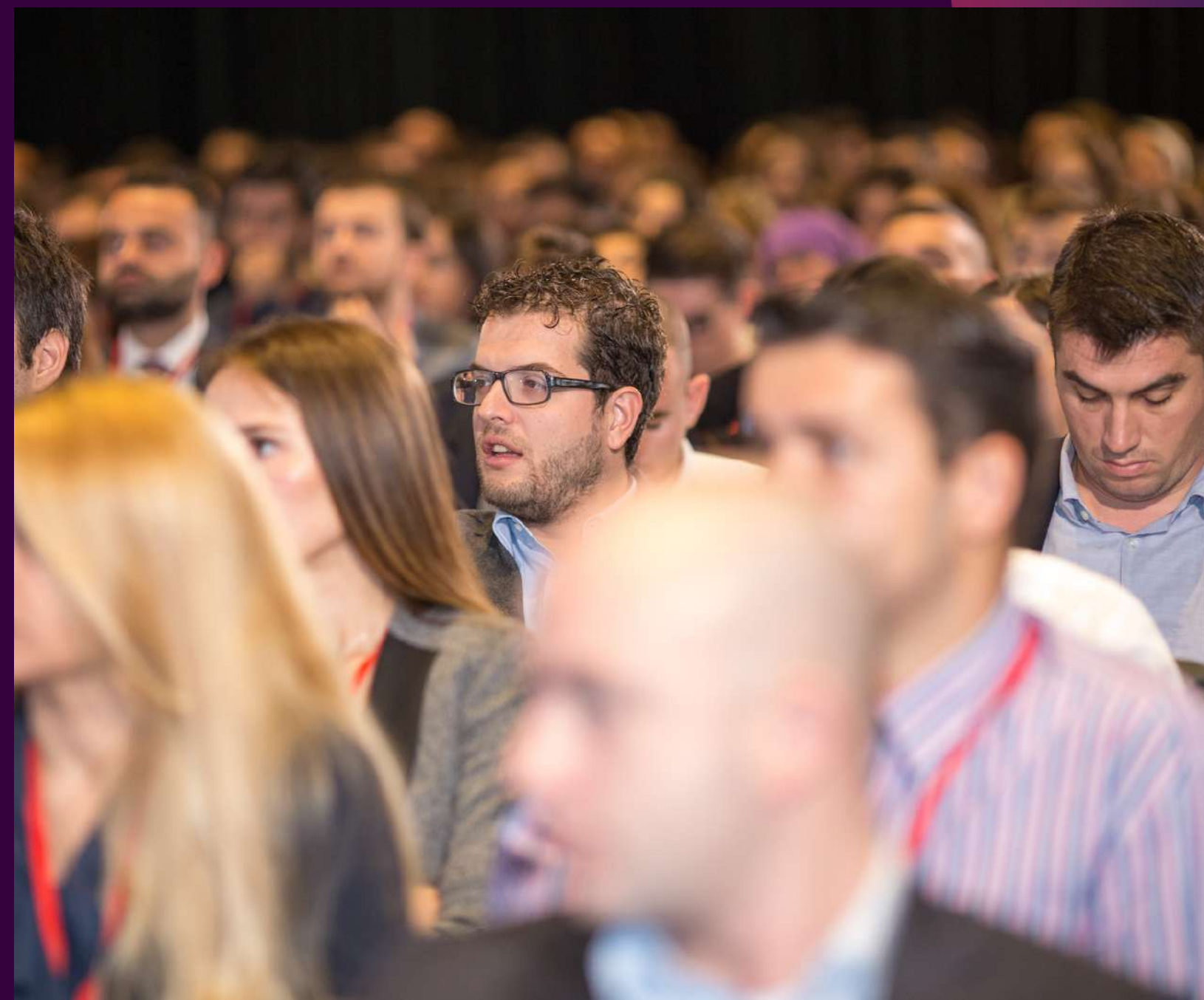
Leader's Summit – Business & Government Round Table