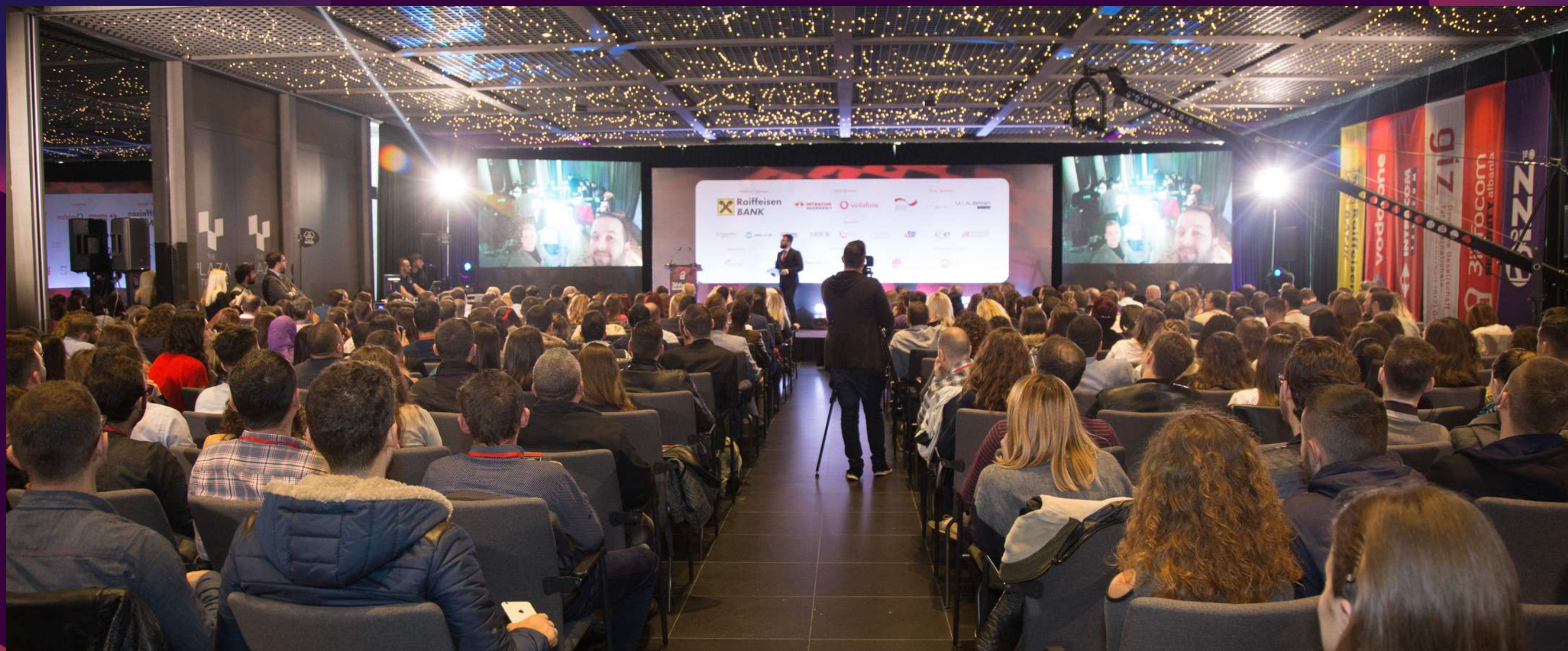
The Main Conference